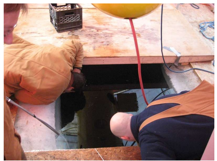
Where did it go???